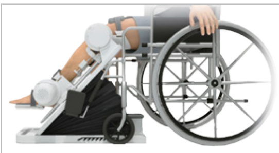
Dorsiflexion & Plantar Flexion (Sitting)