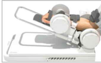
Flexion & Extension (Pronated)