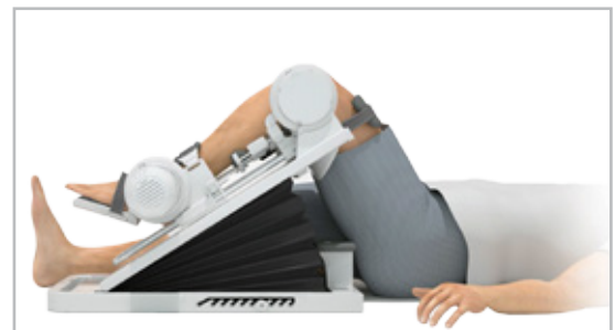
Dorsiflexion & Plantar Flexion (Supine)