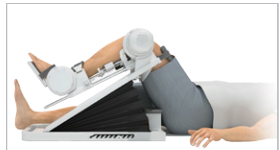
Flexion & Extension (Supine)