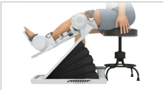
Flexion & Extension (Sitting)