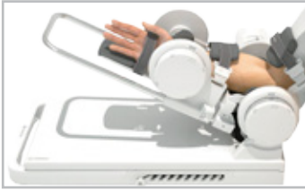
Neutral Flexion & Extension