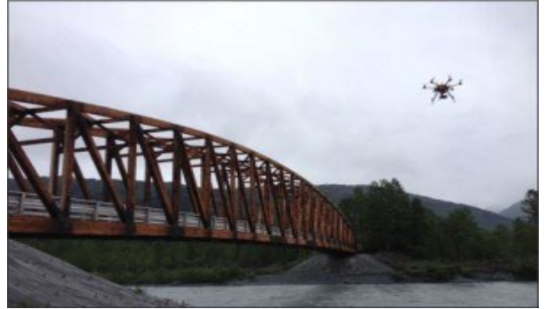
Drone inspecting a bridge

Haiti's devastating 2010 earthquake collapsed much of the Infrastructure essential for disaster response, including every hospital in the capital city, all transportation and every major communication system. This impacted David Lattanzi, an assistant professor at GMU as he realized that faster inspections would allow quicker decisions about the safety of critical facilities, he developed a new approach using high performance computing. Lattanzi uses robotic inspection systems – such as drones – to create virtual 3D models of civil structures, for both routine and post-disaster safety assessments. Lattanzi and his team were among five finalists for NVIDIA'S 2016 Global Impact Award. While Haiti helped broaden Lattanzi's perspective, high performance computing helped sharpen his focus in tackling the biggest issues engineers face during assessments.